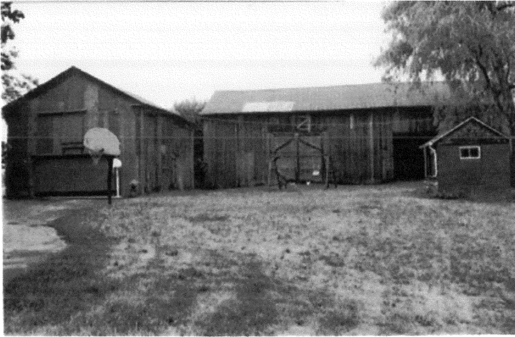
5. Two barns and small concrete block building (E)

Site No. 04-05 Sidwell No. 08-04-100-050