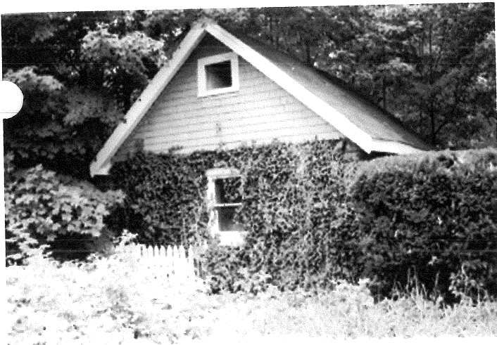
29. Well house (stone)