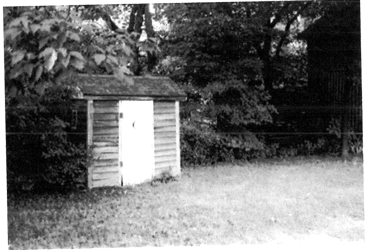
28. Outhouse & crib (in shadows)